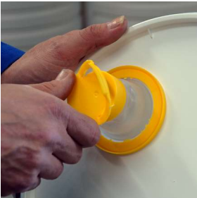
Ultrasonic welding with, for example, flexspout...