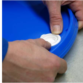
Post installation of lids...