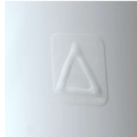
Marking, for example tactile marking...