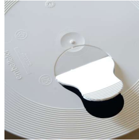
Stamping and perforation...