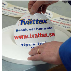
Labelling as you want it...